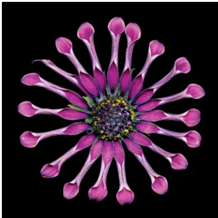
Whirligig African Daisy