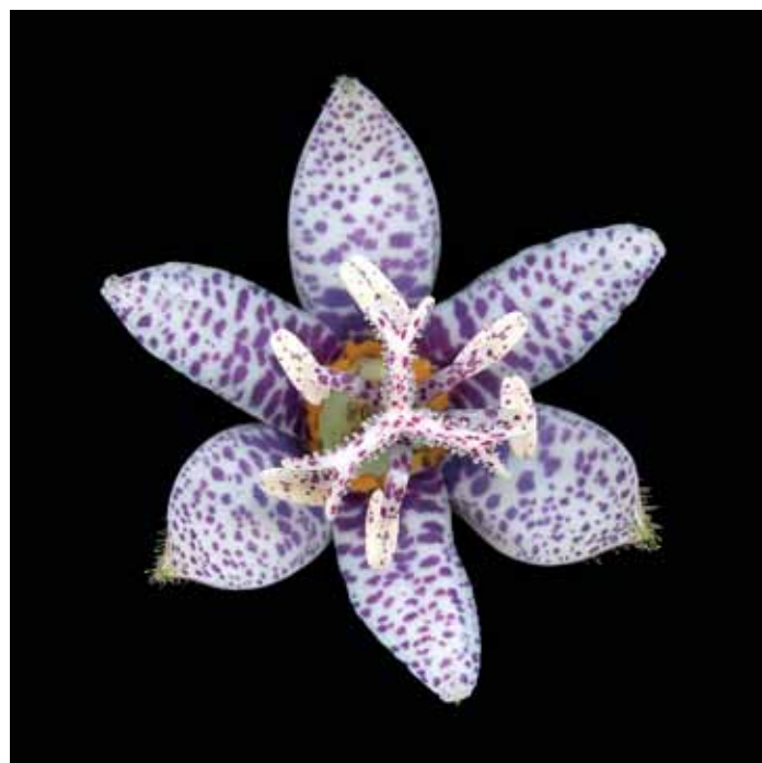
Miyazaki Toad Lily

within three inches of the subject, he'll add the close-up diffusers that come with the R1C1 kit.